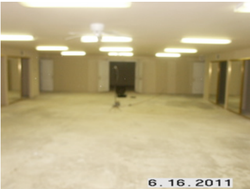
No. 2 – Workout Area/Basement, Facing East