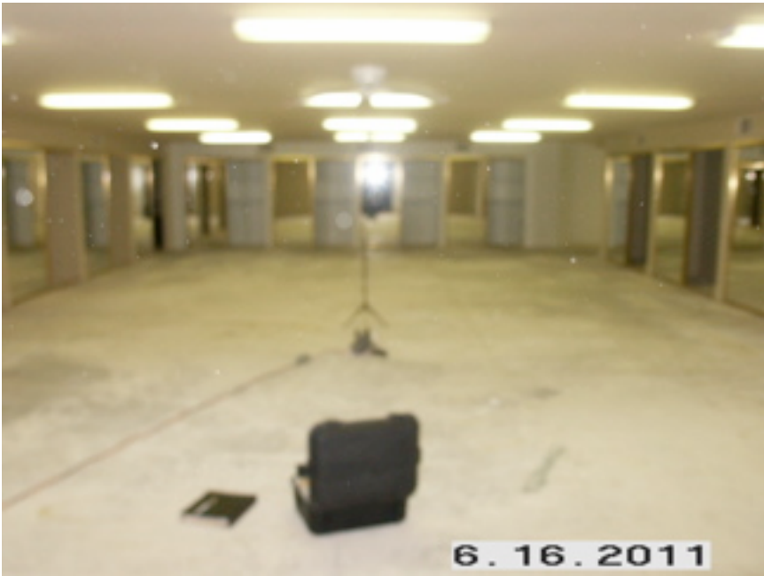
No. 1 – Workout Area/Basement, Facing West