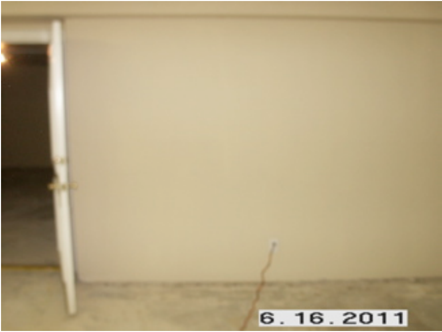
No. 3 – Workout Area/Basement, Facing West Wall Right of Door